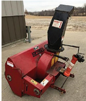
Loftness 3 Pt Snowblower

Several Free Standing Commercial Steel Shelving Units Standing Over 10' Tall & 10' Long; Many Sizes & Dimensions of Other Shelving Units From Office Style to Kitchen Style, Plus Work Tables; Work Benches; Metal Cabinets; Office Chairs; File Cabinets; Commercial Kitchen Equipment includes