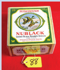
#88 Shot Shell Box