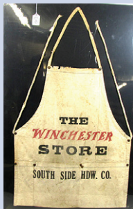
#610 Nail Apron