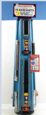
#325 Flashlight Display

of Winchester memorabilia * Great Winchester Advertising * Calendars * Counter Signs, Die Cuts * Window Displays * Great Ammo & Shot Shell Boxes * Fishing Reels & Plugs * Spoon Lines * Pocket Knives * Locks * Catalogs * Reloading Tools * Straw Hats * Flashlight Displays * Tools * Sporting Goods * Football Helmet * Baseball Jersey * Boxing Gloves * Trophy * Cannon * Wood Boxes * Too Much to See Pictures