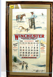
#282 Win Adv