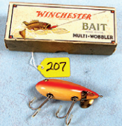
#207 Fishing Plug w/Box