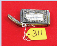
#311 Win Store Match Safe