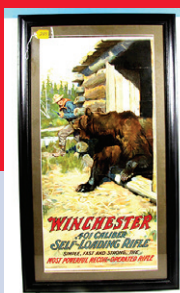
#283 Win Adv