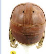
#295 - 2 Football Helmet

of Winchester memorabilia * Great Winchester Advertising * Calendars * Counter Signs, Die Cuts * Window Displays * Great Ammo & Shot Shell Boxes * Fishing Reels & Plugs * Spoon Lines * Pocket Knives * Locks * Catalogs * Reloading Tools * Straw Hats * Flashlight Displays * Tools * Sporting Goods * Football Helmet * Baseball Jersey * Boxing Gloves * Trophy * Cannon * Wood Boxes * Too Much to See Pictures