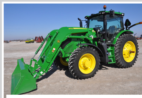
'18 JD 6155R MFWD tractor, 256 hrs.