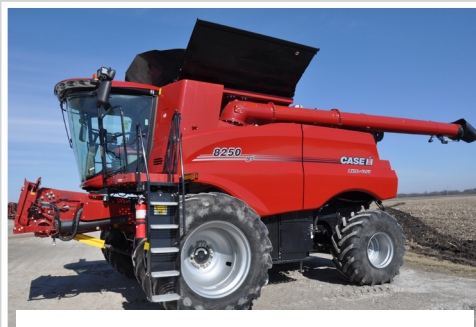
'19 C-IH 8250 4wd combine, 1,545 eng./1,176 sep. hrs.