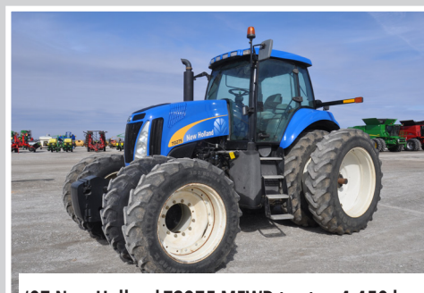
'07 New Holland TG275 MFWD tractor, 4,450 hrs.