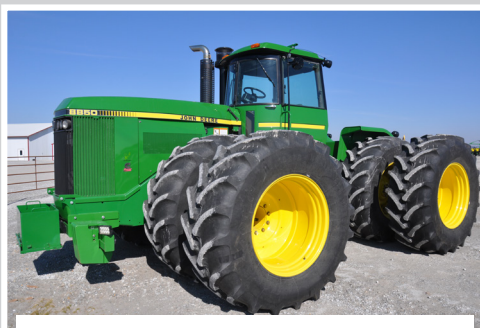
'98 JD 8850 4wd tractor, showing 6,226 hrs.