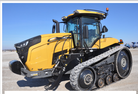
'18 Challenger MT738 track tractor, 3,974 hrs.

ALL ITEMS WILL BE LOCATED AT A SULLIVAN AUCTIONEERS' FACILITY IN ILLINOIS, INDIANA OR MINNESOTA