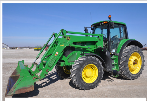
'15 JD 8320R MFWD tractor, 3,970 hrs.