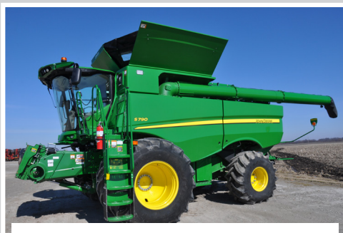
'19 JD S790 2wd combine, 1,270 eng./940 sep. hrs.