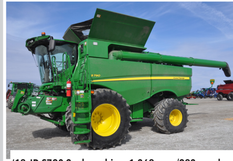
'18 JD S790 2wd combine, 1,368 eng./983 sep. hrs.