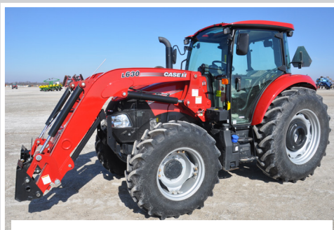
'21 Case-IH Farmall 120C MFWD tractor, 836 hrs.