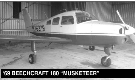
'69 BEECHCRAFT 180 "MUSKETEER"

SALE TO BE HELD AT SULLIVAN AUCTION SITE LOCATED 1 1/2 MILES EAST OF HAMILTON, IL ON HWY. 136