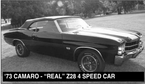
'73 CAMARO - "REAL" Z28 4 SPEED CAR