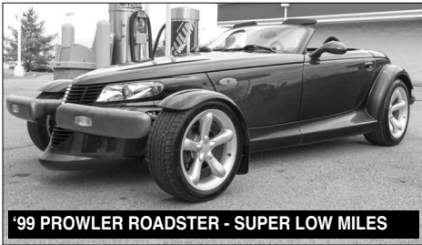
'99 PROWLER ROADSTER - SUPER LOW MILES