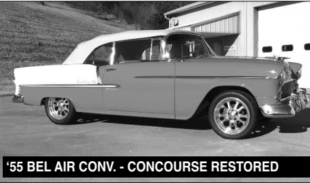
'55 BEL AIR CONV. - CONCOURSE RESTORED