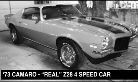
'73 CAMARO - "REAL" Z28 4 SPEED CAR