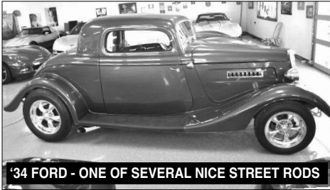
'34 FORD - ONE OF SEVERAL NICE STREET RODS