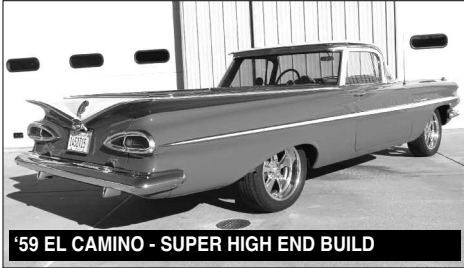
'59 EL CAMINO - SUPER HIGH END BUILD

Make plans to attend this gigantic annual "No Reserve" collector car auction that has grown to be the largest held ANYWHERE in the midwest! This year's sale will include the highest quality and largest quantity of muscle cars & classics that we have ever sold. We invite everyone to come out for an Open House that will be held Sunday afternoon, April 2nd, from 12 Noon - 5:00 P.M. Pre-registration will be available at the Open House to help beat the huge Monday morning rush. Food will be available both days. Be prepared and bring an extra bidder as we will be running (2) indoor auction rings simultaneously. Once again, we hope to see you at this year's Spring Collector Car Auction.