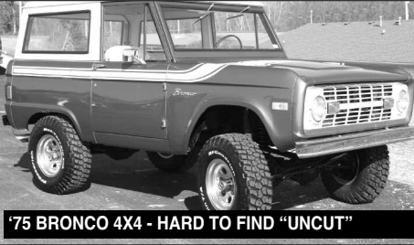
'75 BRONCO 4X4 - HARD TO FIND "UNCUT"