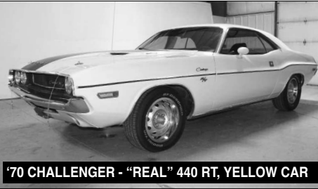
'70 CHALLENGER - "REAL" 440 RT, YELLOW CAR