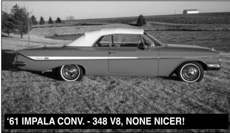
'61 IMPALA CONV. - 348 V8, NONE NICER!