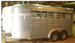
6' 8"x16' Kiefer Built, tandem axle stored indoors