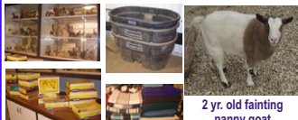
2 yr. old fainting nanny goat