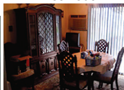
Dining room set w/hutch