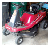
Craftsman 13.5HP 30" Cut