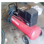
Craftsman 3.5HP 15 gal air compressor