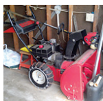
MTD 8/26 2 stage snowblower