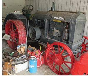
McCormick Deering 10-20 Tractor!