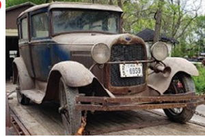
1929 Model A Car!

Home Furnishings: Kenmore Washer, Whirlpool dryer, Chest Freezer, Full size bed, Desk, etc.