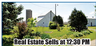
Real Estate Sells at 12:30 PM

General Description: Offering this 4 bdrm, 1 bath, 2-story Century Farm home, in a quiet rural setting on a beautifully landscaped property of 4 acres m/l. Large eat-in kitchen w/lots of cabinet space & included in the sale, is a built-in stove, a smooth top range & a refrigerator. Attached 24'x26' garage w/breezeway. Large walk-up attic, hardwood floors, new Thermopane windows & yellow pine woodwork throughout the home. On property are 2 Morton bldgs, a barn, 2 sheds & a chicken coop that has been converted into a craft and storage facility, all w/concrete floors..