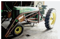
JD 50 S# 5014201, NF w/Stanhoist loader