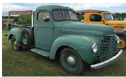
'47 IH Pickup