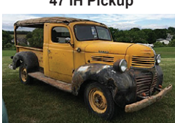
'47 Dodge Canopy Express