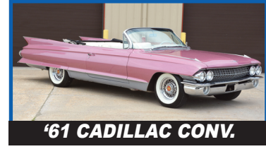
'61 CADILLAC CONV.