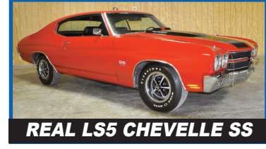
REAL LS5 CHEVELLE SS