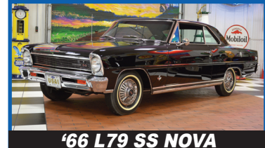
'66 L79 SS NOVA