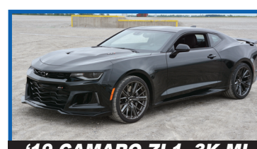
'19 CAMARO ZL1, 3K MI.