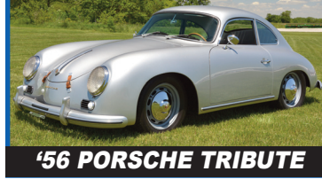
'56 PORSCHE TRIBUTE