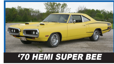
'70 HEMI SUPER BEE