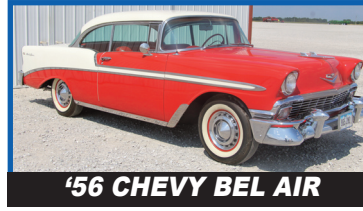
'56 CHEVY BEL AIR