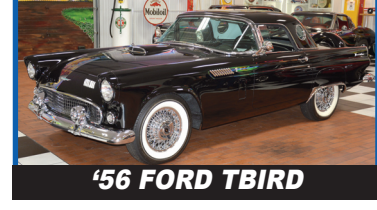
'56 FORD TBIRD