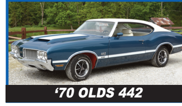
'70 OLDS 442