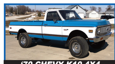
'70 CHEVY K10 4X4