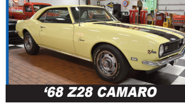
'68 Z28 CAMARO