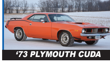
'73 PLYMOUTH CUDA