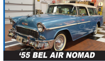
'55 BEL AIR NOMAD