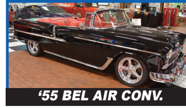
'55 BEL AIR CONV.