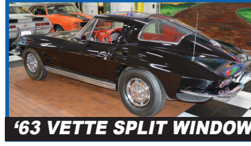
'63 VETTE SPLIT WINDOW