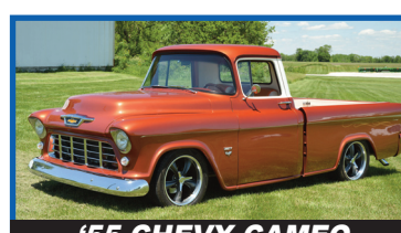
'55 CHEVY CAMEO