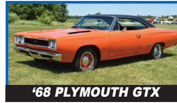
'68 PLYMOUTH GTX