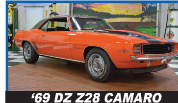
'69 DZ Z28 CAMARO