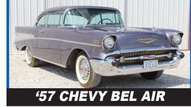
'57 CHEVY BEL AIR