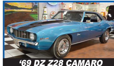
'69 DZ Z28 CAMARO