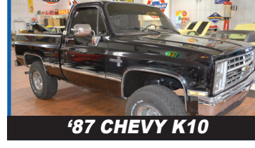
'87 CHEVY K10