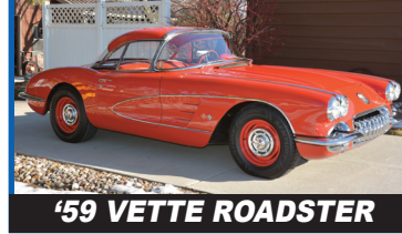
'59 VETTE ROADSTER