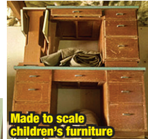
Made to scale children's furniture