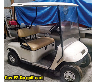
Gas EZ-Go golf cart