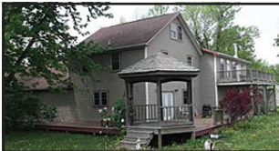
Rear view w/gazebo, upper & lower deck!