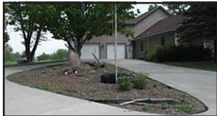
Front view showing paved circle drive, Trees! Landscaping!

Location from Knoxville: 2 miles west off Hwy #92 (Easy commute to Des Moines or Indianola)