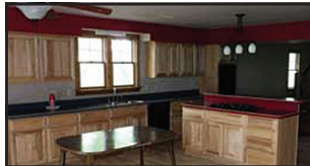
Spacious Kitchen w/built-in appliances & Hickory Cabinets!

General Description: Offering this spacious 6 Bedroom home w/ 3 full baths. Over 5200 sq. Ft. Living area! Gourmet kitchen w/built in appliances, Hickory Cabinets & hard wood floors! Master bedroom with sitting room, walkout to 2nd story deck overlooking 13 acres of pasture & timber! Newer electrical and plumbing. Pella windows! Paved drive, Rural water & deep well.