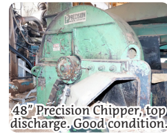
48" Precision Chipper, top discharge. Good condition.