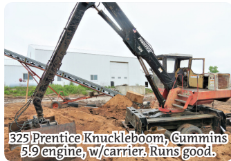
325 Prentice Knuckleboom, Cummins 5.9 engine, w/carrier. Runs good.