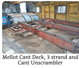
Mellot Cant Deck, 3 strand and Cant Unscrambler