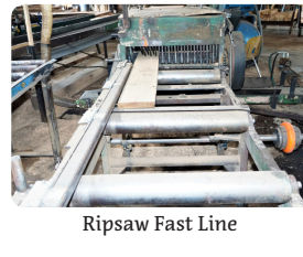
Ripsaw Fast Line