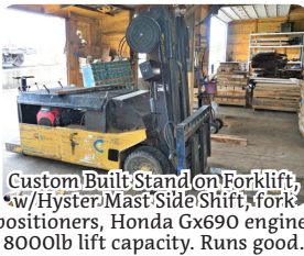
Custom Built Stand on Forklift, w/Hyster Mast Side Shift, fork positioners, Honda Gx690 engine, 8000lb lift capacity. Runs good.