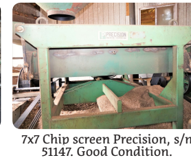
7x7 Chip screen Precision, s/n 51147. Good Condition.