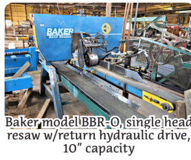
Baker model BBR-O, single head resaw w/return hydraulic drive, 10" capacity