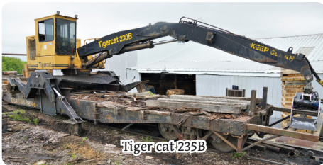
Tiger cat 235B