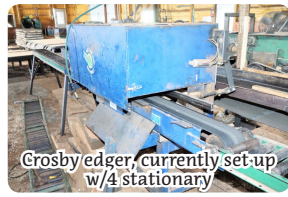
Crosby edger, currently set-up w/4 stationary

Terms: Payment in full day of sale. Cash, check, or major credit card. 2% convenience fee for all credit/debit card transactions. All items sell absolute unless otherwise advertised. 10% buyer's premium applies to all onsite purchases and 13% to all offsite purchases.