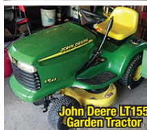
John Deere LT155 Garden Tractor