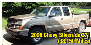
2006 Chevy Silverado Z71 (38,150 Miles)