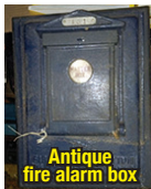
Antique fire alarm box