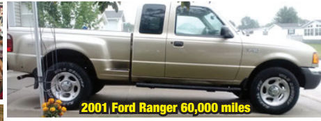
2001 Ford Ranger 60,000 miles