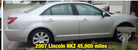
2007 Lincoln NKZ 45,000 miles