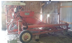
Allis-Chalmers round baler