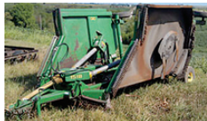
JD 1518 Flex-wing mower