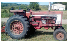
Farmall 806 wide front diesel S# 36104 SY