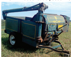
Gain-O-Vator auger wagon