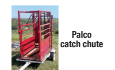
Palco catch chute

Bales of Hay: 11 Large round 200 small square