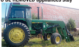
JD 4440 WF w/695 loader, 8806 hrs