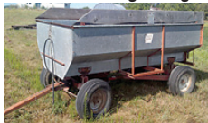
Flare auger wagon