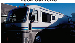
American Eagle motorhome 300hp Diesel pusher 40ft