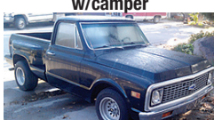
1969 Chevy 1/2 ton 350 shortbox