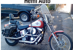
1998 Harley Softail Custom 8,300 miles