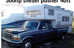
1997 Ford 350 Club Cab w/camper