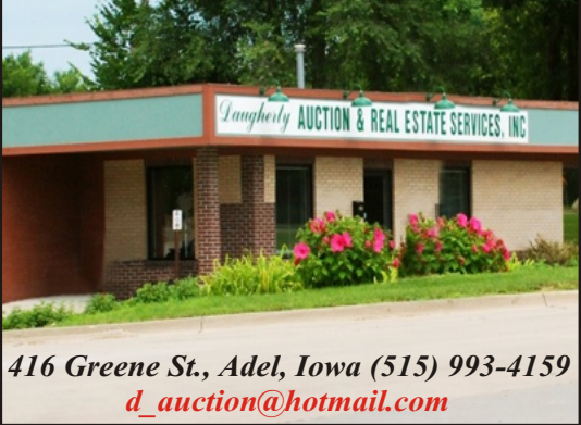
416 Greene St., Adel, Iowa (515) 993-4159 d_auction@hotmail.com