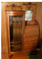
Oak curved glass combination bookcase and secretary

Saturday, October 3, 2015 starting at 10:00 a.m. Sharp.