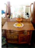
Oak commode with towel bar