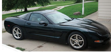
2000 Chevy Corvette 5.7 liter, Loaded! Leather seats, Cruise control, Bowe stereo, Green w/ only 101,000 miles! Vin# 1G1YY22G8Y5125241

Dozens Die cast cars new in the boxes Modern Tin signs, Collector's knives 2 barstools, Trestle table & chairs Drop side table Modern 4 stack bookcase Knee hole desk & chair Oak hutch w/glass doors Oak bedroom set Lawn & garden tools, Car ramps Carpet layer's tools Schwinn mens bicycle New dimensional lumber: 20-2x6x10's Alum appliance dolly Squirrel cage, stepladders, hand tools, jack stands 4 GoodYear Eagle tires (P2540zR17's)