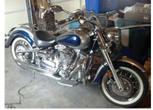
2007 Yamaha Silverado Roadster! 1670cc w/only 5,300 miles! Vin# JYAVP17Y67A003195