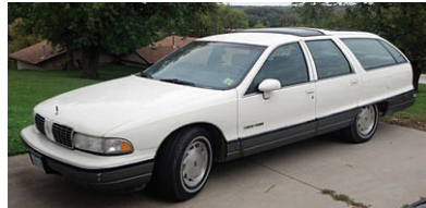
1991 Olds Custom Cruiser! 8 cyl. Cruise, PW, PL, Only 82,436 miles! Vin# 1G33P83E9MN302446M