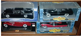
Many boxed "new" collectible die cast cars