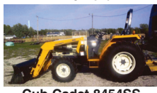
Cub Cadet 8454SS