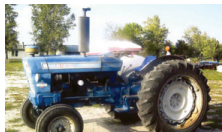
7000 Ford Tractor