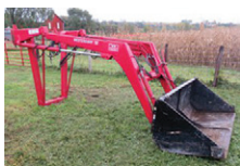
Westendorf WL40 Quick Tach Loader 7 ft. bucket, bale stabber & manure bucket, IH mts.