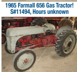
Ford 8N Tractor