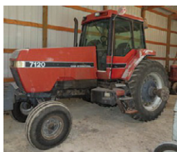
1989 Case IH 7120 Diesel Tractor! Duals~10 Front weights~4 hyd. ports, New cab kit & seat S# JJA0008621

Re-mfg. Engine w/rebuilt injectors, 5,180 hours, S#1700223U013676