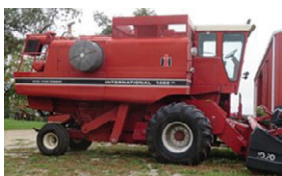
1980 International 1460 Diesel Combine!

Ritchie feeders, Water tanks Fencing tools & materials LBN White heaters, 80 gal propane tank Endgate seeder, IH Frt. weights, quick tach Ford segment weights, HD Vise on stand Craftsman 5HP 20 gal. compressor Power hacksaw, 20 ft. sickle for 1020 head Greenfield fold down stock rack 100 gal. split sq. gas tank w/pump.