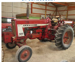
1966 Farmall 706 Gas Tractor! S# 38496, 5,885 hours