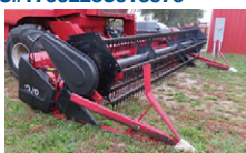
IH 1020 20 ft. Bean Table S#003344 w/head mover