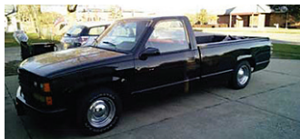
1998 Chevy Silverado, Auto, 2WD, has been lowered, 122,982 miles