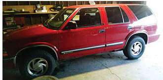
2000 Chevy Blazer LT 4x4, Auto, 116,148 miles