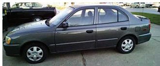
2001 Hyundai Accent Auto, 103,216 miles