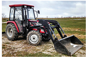
2009 Foton 504 w/Westendorf loader 50HP, 4x4, heated cab, Only 400 hrs!