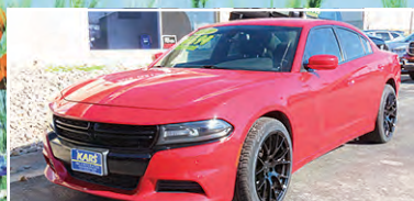
2016 Dodge Charger Police, AWD, 5.7 Hemi, Auto, Full Power, MP3 $16,995