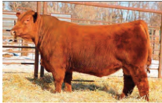
Sons of RREDS Pioneer sell!