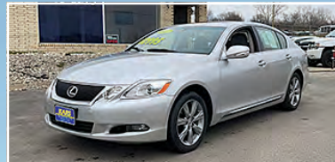
2008 Lexus GS 350 AWD, V6, Auto, Air, Loaded, Heated Leather, Sunroof, 90K $12,995