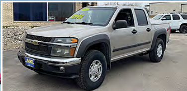
2006 Chevy Colorado LT w/2LT 4x4, Crew Cab, 3.5 5 Cyl, Auto, Air, Loaded, Fiberglass Bed Cover, 121K $12,995