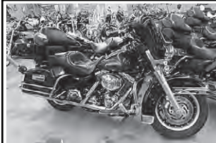
2006 Harley Classic Only 69K Miles