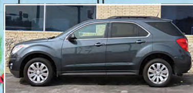
2011 Chevy Equinox LT w/2LT 4 Cyl Auto, Loaded, Heated Leather, Full Power, 105K $8,995