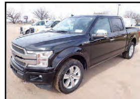
DJ0192 '18 Ford F150 Platinum SuperCrew pickup

610+ ITEMS SELL NO RESERVE! WEDNESDAY, APRIL 7