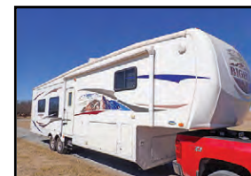
DJ0094 '08 Heartland Big Horn camper