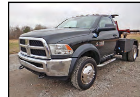
HX9181 '14 Dodge Ram 4500HD tow truck