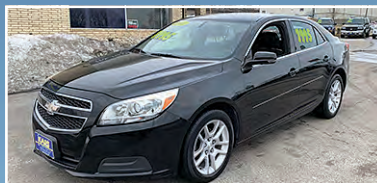
2013 Chevy Malibu LT 4 Cyl, Auto, Full Power, Backup Camera, Hard Disc Media Storage, 132K $8,995