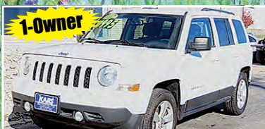
2017 Jeep Patriot Sport 4 Cyl, Auto, Well Equipped, 91K $10,995