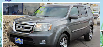
2010 Honda Pilot Touring AWD, V6, Loaded, Leather, Sunroof, 3rd Row Seating $13,995