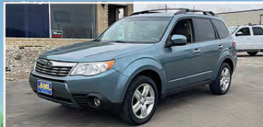
2009 Subaru Forester 2.5X Limited 4 Cyl, Auto, Full Power, Sunroof, 99K $8,995