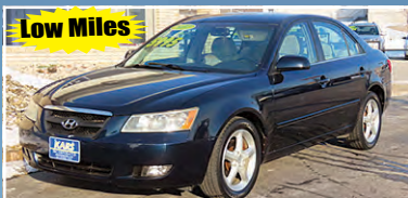
2007 Hyundai Sonata SE V6, Auto, Nicely Equipped $5,995

2000 E. Euclid Des Moines, IA 515-265-0215