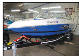
HG9968 '06 Tige 24Ve boat