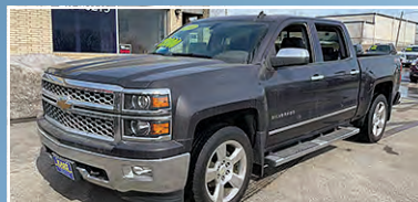
2014 Chevy Silverado K1500 LTZ Crew Cab, 4x4, 5.3 V8, Auto, Loaded, Sunroof, Heated Leather, Full Power, CD/MP3/HD Radio, 145K, $23,900