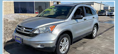
2011 Honda CR-V EX 4WD, 4 Cyl, Auto, Air, CD Changer, Sunroof, Keyless Entry, 93K Miles $10,995