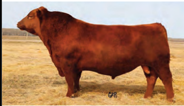
Sons of Opportunity 53Y sell!

Wednesday April 14, 2021 6:00 p.m. at the NEW Gilchrist Auction Facility 12144 Dove Ave., Douds, Iowa