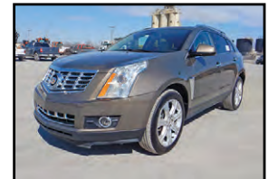
DJ8710 '15 Cadillac SRX SUV