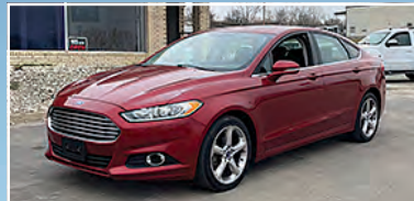
2014 Ford Fusion SE 4 Cyl, Auto, Air, Full Power, Sunroof, 93K $9,995