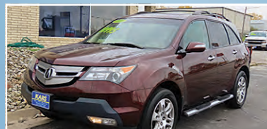
2009 Acura MDX AWD, V6, Auto, Loaded, Leather, Sunroof, 3rd Row Seating $10,995