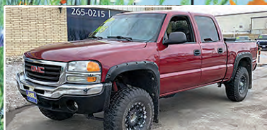
2005 GMC Sierra K1500 Crew Cab, 4x4, 5.3 V8, Auto, Heated Mirror, Full Power, Keyless Entry $9,995