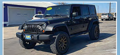
2011 Jeep Wrangler Sport 4x4, 3.8 V6, Auto, Air, CD/MP3, 122K $20,995