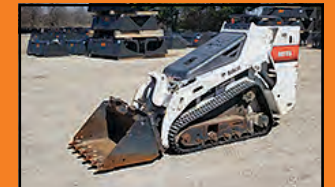
2016 Bobcat MT85 25hp, 1538hrs, Ride on.....$23,900