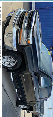
2017 Silverado K1500 LT, 4WD, Crew Cab, 5.3 V8, Leather, Full Power, CD/MP3, WiFi, Hotspot, 135K, $25,995