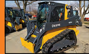
2022 Deere 325G "Warranty" UNUSED, AC/Cab, Joystix.....$75,995