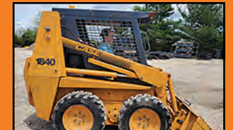
2000 Case 1840 54hp, 967hrs, H Controls, NEW Tires .....$26,900