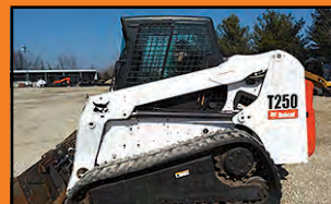
2008 Bobcat T250 "HiFlow" 81hp, 3739hrs, AC/Cab, Joystix.....$42,900