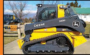
2022 Deere 333G "HiFlow" UNUSED AC/Cab, Joystix..... Starting at $104,995

Craig Equipment 2681 W. Pearce Blvd | Wentzville, MO 63385 636-856-8555 www.CraigEquipment.com