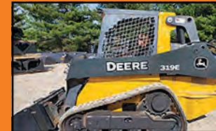
2015 Deere 319E 69hp, 1874hr, Joystix, NEW Trax.....$37,500