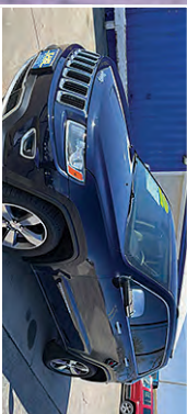
2014 Grand Cherokee Limited, 4WD, V6, Loaded, Leather Sunroof, Heated Seats, 99K, $19,995