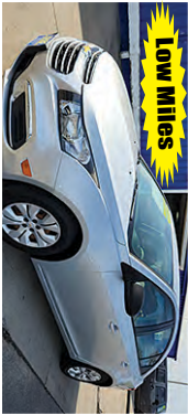
Low Miles 2016 Chevy Cruze Limited LS, 4 Cyl, Auto, Power Windows & Locks, CD/MP3, WiFi, Hotspot, Low Miles, 67K, $12,995