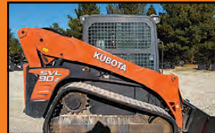
2015 Kubota SVL90 92hp, 2943hr, AC/Cab, Joystix, 2sp.....$45,500