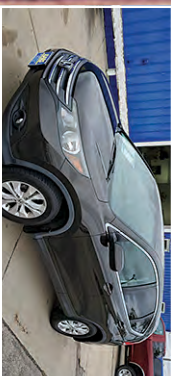
2014 Honda CR-V EX, AWD, Nicely Equipped, CD/MP3, Sunroof, 133K, $14,995