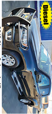
Diesel 4x4, Crew Cab, 2.8 Duramax Diesel, Full Power, 113K, $22,995