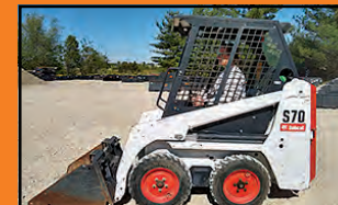
2014 Bobcat S70 24hp 1201hrs 36" smooth bkt included .....$19,995