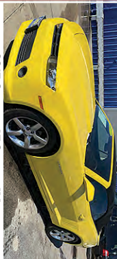
2015 Camaro LT Convertible, V6, Auto, Full Power, 70K Miles, $20,995