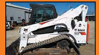
2021 Bobcat T870 "HiFlow" 100hp, WRNTY, 540hrs, AC/Cab, Joystix...$89,900