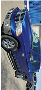
4x4, Crew Cab, V6, Loaded, Full Power, Bed Cover, 94K, $25,995