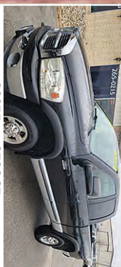
2007 Ram 2500 ST, 4x4, Quad Cab, Cummins Diesel, Well Equipped, Only 131K Miles, $25,995