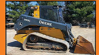
2019 Deere 333G "HiFlow" 100hp, 1855hrs "Wrnty" PolyDoor AC/Cab Joystix.....$64,900