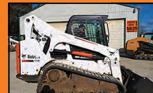
2015 Bobcat T770 "HiFlow" 92hp 2258hrs AC/Cab Joystix, 2sp.....$55,500