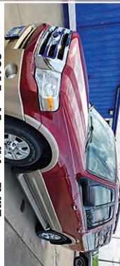
4WD, 5.4 V8, Loaded, Full Power, Leather, 3rd Row Seating, 114K, $18,995