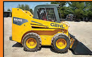
2005 Gehl 6640 82hp, 710hr, T-BAR CONTROLS.....$29,900