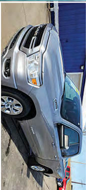
2020 Ram 1500 Big Horn/Lone Star, 4x4, Quad Cab, V6, Full Power, Keyless Entry & Start, 59K, $21,995