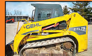
2010 Gehl CTL75 83hp, 1435hrs, AC/Cab, Joystix, 2sp.....$43,500