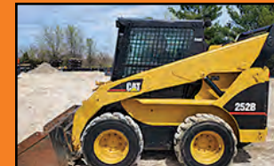
2006 Cat 252B 73hp, 3566hrs, AC/Cab, Joystix, PwrBkt Chngr.....$31,500