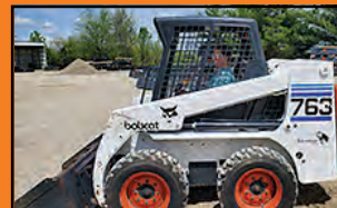
2000 Bobcat 763 "LIKE NEW", 106hrs, 46hp, NEW Tires .....$34,900