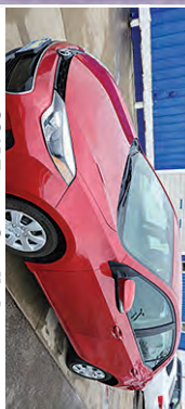
2014 Toyota Corolla I, 4 Cyl, Auto, Nicely Equipped, CD/MP3, Backup Camera, 94K, $14,995