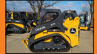
2022 Deere 317G "Warranty" UNUSED, OROPS, Joystix..... Starting at $64,995