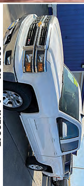
2015 Silverado K1500 LT, Crew Cab, 4x4, 5.3 V8, Z71, Full Power, 176K, $15,995