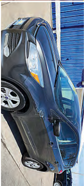
2016 Ford Escape SE, 4WD, EcoBoost, Full Power, 115K, $10,995