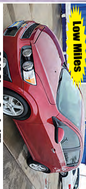
Low Miles 4 Cyl Turbo, Loaded, Heated Frt Seats, Leather, CD/MP3, 64K, $11,995