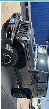
2017 Jeep Wrangler Rubicon, V6, 6 Spd, Leather, Loaded, MP3, 145K, $26,995