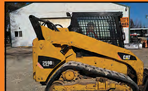
2011 Cat 259B3 75hp, 2speed, AC/Cab, Joystix.....$37,500