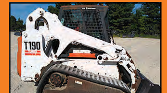
2004 Bobcat T190 66hp, 2568hrs, AC/Cab, PwrBktChngr.....$34,500