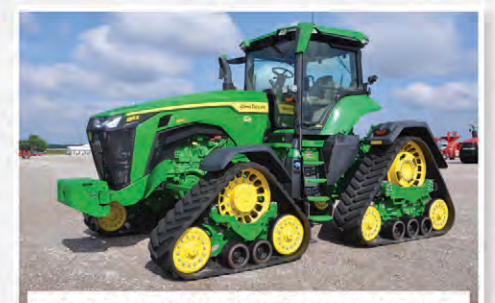
'21 John Deere 8RX370 track tractor, 1,683 hrs.

New Holland T8040 MFWD tractor, 2,384 hrs.