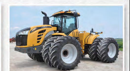
'19 Challenger MT965E 4WD tractor, 2,011 hrs.