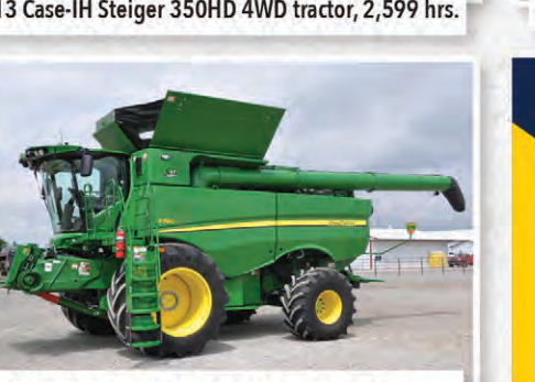
'22 JD S780 4WD combine, 421 eng./325 sep hrs.