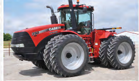
'13 Case-IH Steiger 350HD 4WD tractor, 2,599 hrs.