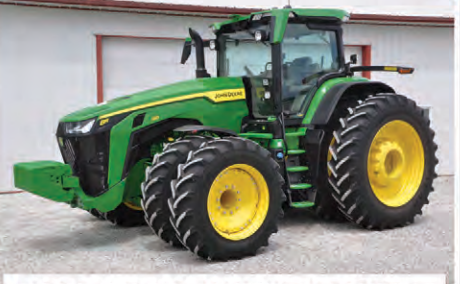
'22 John Deere 8R310 MFWD tractor, 342 hrs.