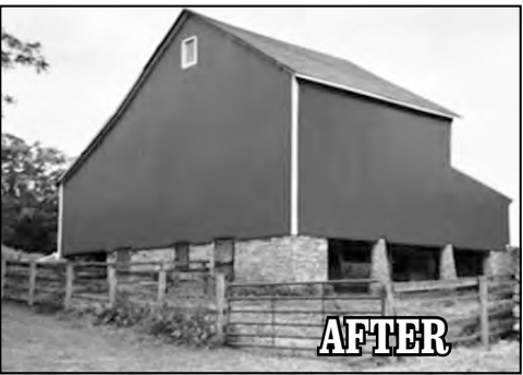
303 Cleveland St Muscatine, IA 52761

Email: amminfo7@gmail.com www.affordablemetalmfg.com